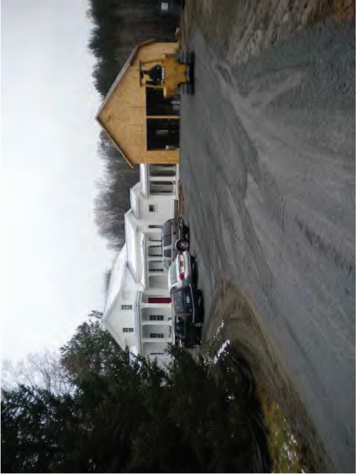
stone driveway for historic and environmental value