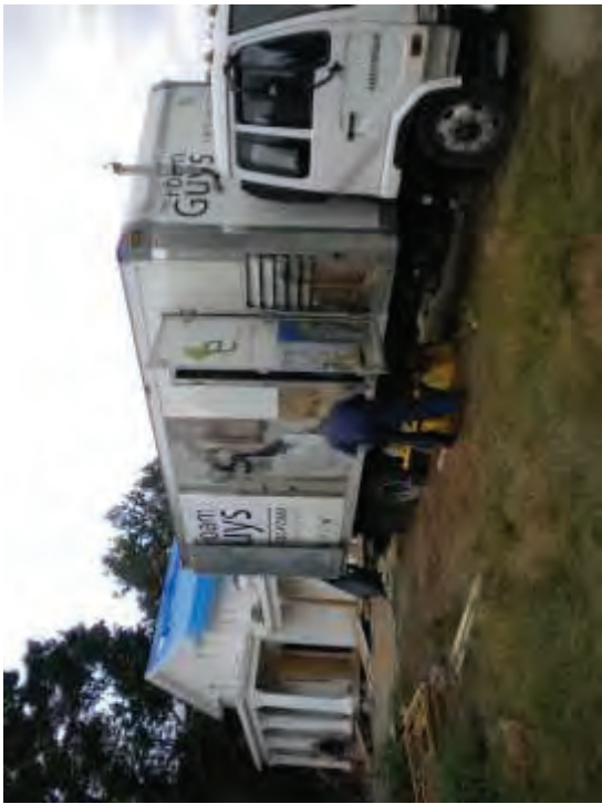
closed cell foam insulation