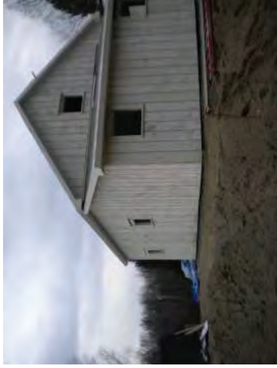
Local pine siding