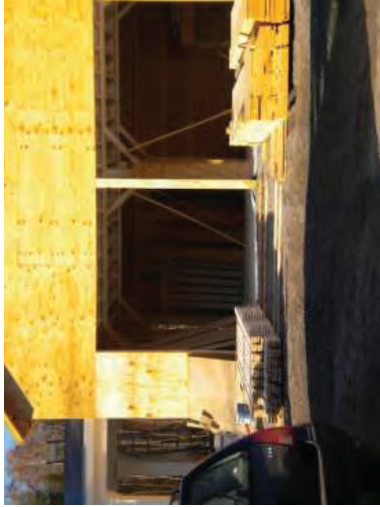
barn under construction