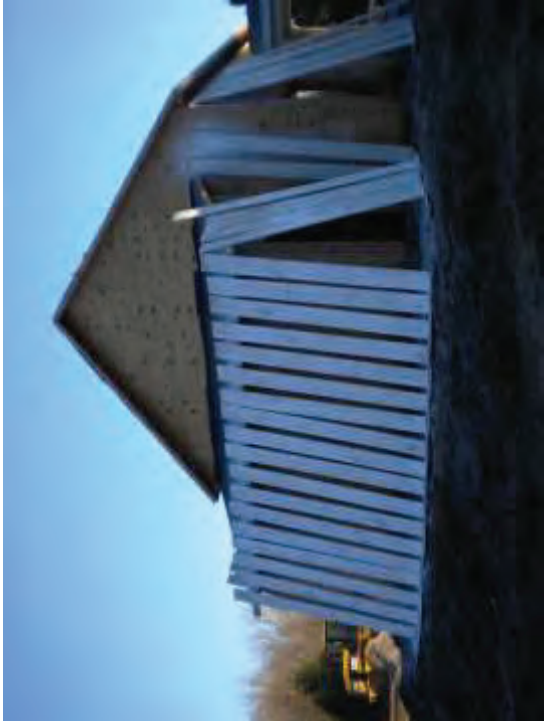
painting barn siding